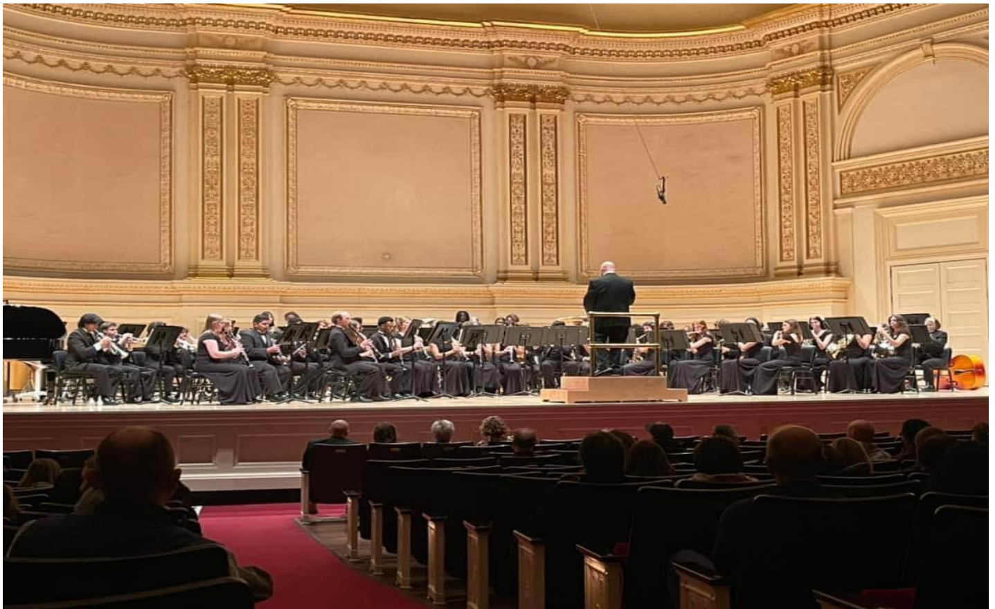
Above: The 2023-24 HCHS Wind Symphony performing at Carnegie Hall. All bands perform 3-4 concerts a year and regularly participate in GMEA events. Students enrolled in band classes also work with sectional coaches during their band class once a week.

Students who join the Houston County High School Band program will be placed into one of four concert band classes that meet daily as part of the seven-period academic schedule. Percussionists will be placed in their own class, as well. Unlike middle school band, each of the four band classes is ability-based, and therefore, has a mix of 9 th -12 th grade students. Most freshmen are placed into the Concert Band II, but some advanced players will be placed into the Concert Band I, Symphonic Band, or Wind Symphony. All students who sign up for band class will receive class placement materials and information in the spring. Band class placement auditions will take place in April. The class placement audition is nothing to worry about; we have a place for everyone, regardless of ability or experience. However, we want to ensure that everyone is placed into the correct class.